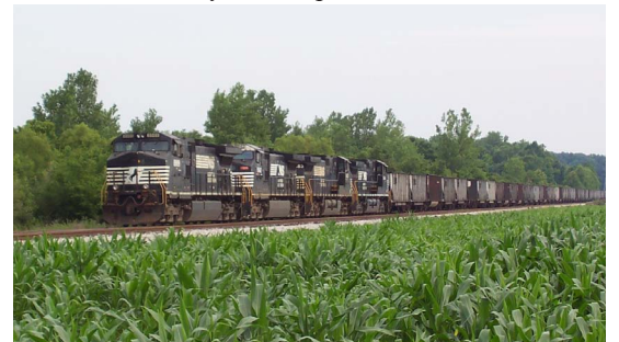
NS #8989, D9-40CW, waits for a crew to depart Yankeetown. This was the first train I noticed utilizing the docks since the 1990’s -Matt Gentry 7/1/07

So the neat part about this is that it can be modeled in a modern setting and not be totally out of place, and it would be unique to my layout... that I’m still planning! I have an idea on track plans, but those may be revealed in a part 2 segment!