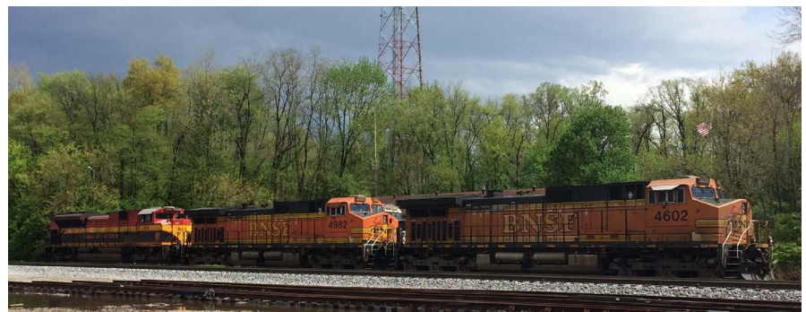
Top: CSX switcher #1228 leads a short manifest northbound with the Vanderburgh Co 4H grounds just beyond the tracks in Evansville IN. 5/9/14