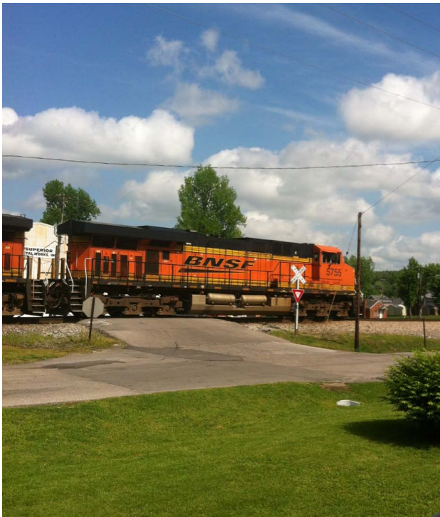
Above: BNSF 5755 leads a southbound through Morton's Gap KY on a beautiful Saturday afternoon. 5/10/14

Train spotting must have been a whole lot more interesting back in the days before all the mergers. You will enjoy this DVD set and I recommend it highly.