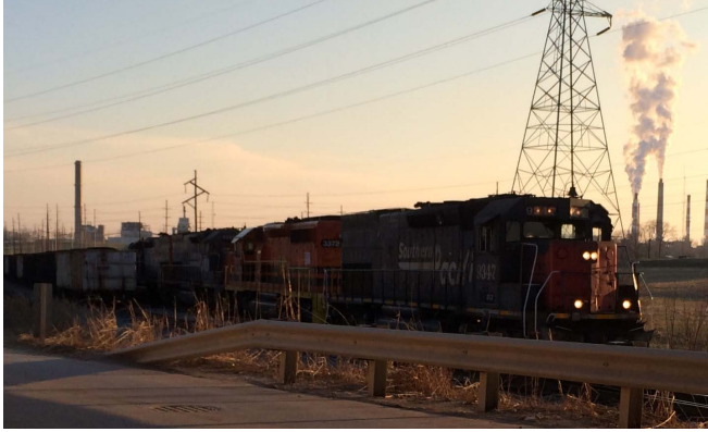
Ex Southern Pacific #9347, model SD45T-2, waits for permission to leave the yard to fetch another load of coal for the docks. 4/5/14

I can remember years ago, early 1990’s, when trains were a normal sight heading into the dock’s. My best memory is of the Squaw Creek U33C locomotives pulling into the small yard at Yankeetown. I honestly don’t ever remember