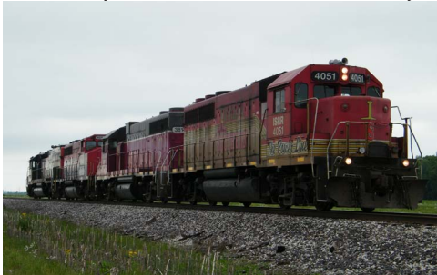
Indiana Southern GP40 #4051 waits for permission to enter the yard at Yankeetown to pick up its train. -Matt Gentry 5/14/11

seeing the SD38-2 locomotives. I can only assume that rail traffic stopped moving at the docks in 1998 when the last (that I found documented) Lynnville mine ceased operations.