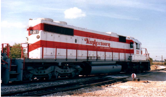
Top: Alco RSD15 #9842 & U33C #3809 pull a loaded coal train towards the Yankeetown docks, crossing at Roeder Rd in Warrick Co. IN. Bottom: YDC SD38-2 #21 sits at the Yankeetown Docks awaiting its next assignment.