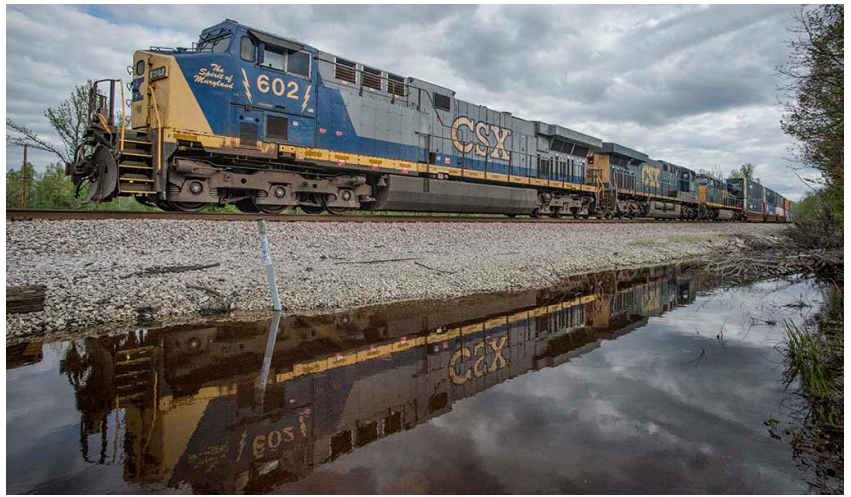
Above: May 2, 2014 - CSX Q026 with the "Spirit of Maryland" 602 in the lead heads north approaching South Romney just outside Mannington, Ky on the Henderson Subdivision.

PENNYRAIL is your publication. If you have photographs or other material of current or historical interest that you would like to share with Chapter members, your editor would appreciate hearing from you. Your material will receive the best of care while being readied for publication. Your help is appreciated.