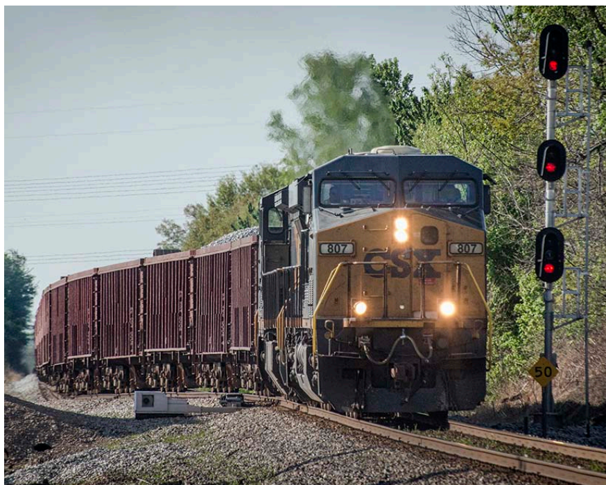
Above: May 6, 2014 - CSX work train WA03 moves from the siding to the main at North Robards as it moves north on the Henderson Subdivision with a loaded ballast train at Robards, Kentucky.