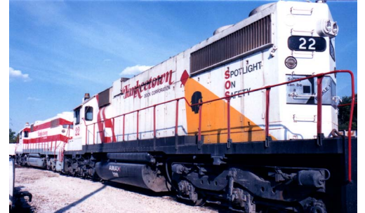
Seen in the glory days, YDC #20 & #22 sit awaiting assignment at the Yankeetown Docks.

I knew I could use modern Norfolk Southern diesels as I see them all the time on the line. I could also use Norfolk Southern Heritage units! Rich Hane has